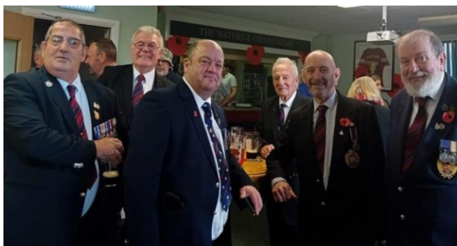
Plymouth branch rehydrating after putting in some serious yards on the parade.