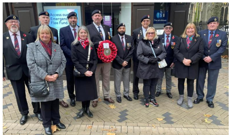
Wakefield members just before the parade in the town centre.

To take part in local Remembrance parades contact your local branch or use SapperCom to corral sappers in your area.