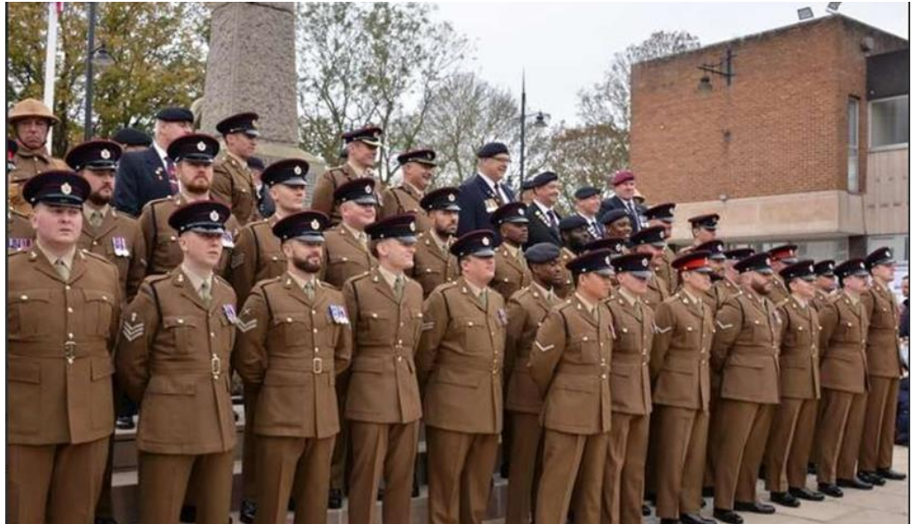
The Fenland Sappers on Parade in March, Cambs with members of 42 Engr Regt (Geo).