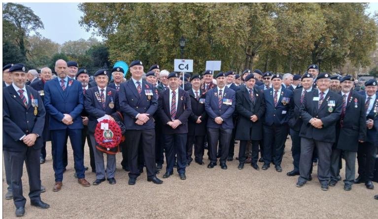
RE Apprentices forming up on Horse Guards Parade before the marching past the Cenotaph on Whitehall